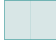
Spread 460 x 297 mm