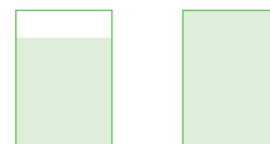
Back cover 1/1 210 x 262 mm