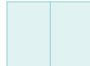
Spread 420 x 297 mm